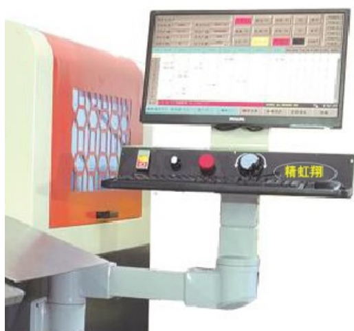
3D bending product display